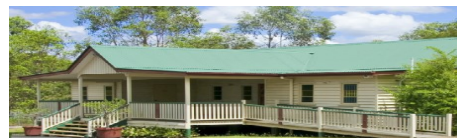
Our Lady of the Assumption 4095-4105 Mt Lindesay H'way Park Ridge South Qld 4125 Stoney Camp Road Exit Mt Lindesay Highway