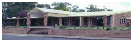
St Bernardine's Church 25 Vergulde Road Regents Park Qld 4118