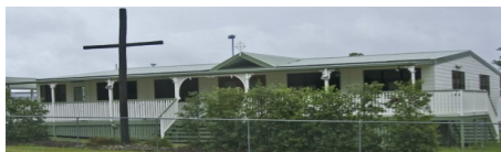
St Catherine's Church 74-76 East Street Jimboomba Qld 4280