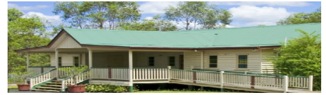
Our Lady of the Assumption 4095-4105 Mt Lindesay H'way Park Ridge South Qld 4125 Stoney Camp Road Exit Mt Lindesay Highway