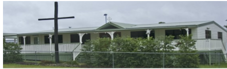
St Catherine's Church 74-76 East Street Jimboomba Qld 4280