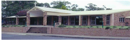
St Bernardine's Church 25 Vergulde Road Regents Park Qld 4118