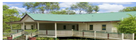
Our Lady of the Assumption 4095-4105 Mt Lindesay H'way Park Ridge South Qld 4125 Stoney Camp Road Exit Mt Lindesay Highway