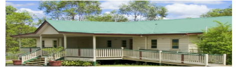
Our Lady of the Assumption 4095-4105 Mt Lindesay H'way Park Ridge South Qld 4125 Stoney Camp Road Exit Mt Lindesay Highway