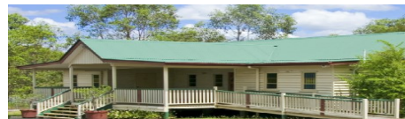
Our Lady of the Assumption 4095-4105 Mt Lindesay H'way Park Ridge South Qld 4125 Stoney Camp Road Exit Mt Lindesay Highway