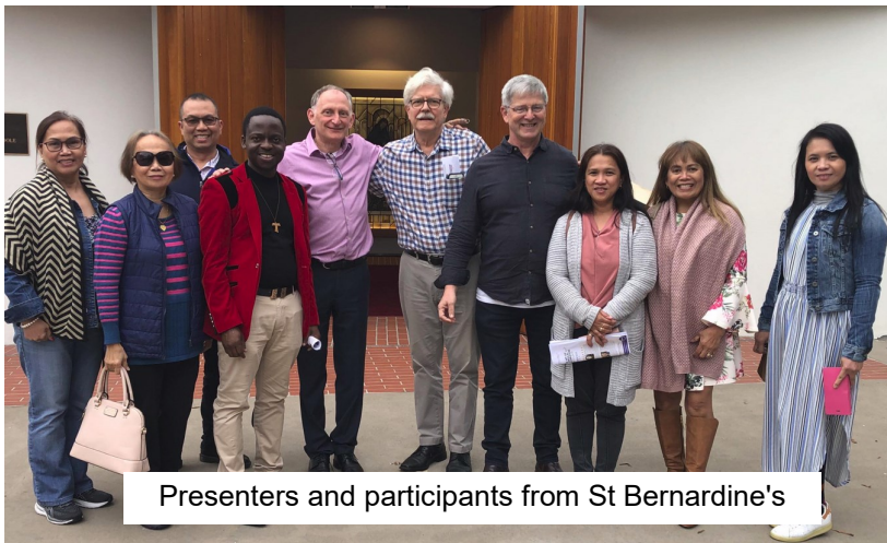
Presenters and participants from St Bernardine's

We look forward to attending the conference as well.