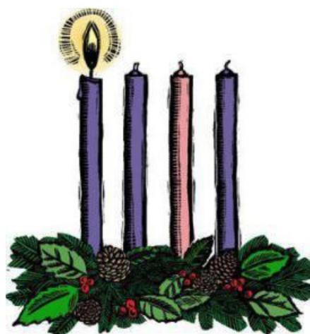
First Sunday in Advent