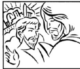
Then Jesus was led by the Spirit into the desert to be tempted by the devil. Matthew 4:1 (NIV)