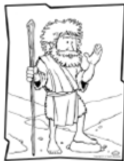
JOHN THE BAPTIST Matthew 3